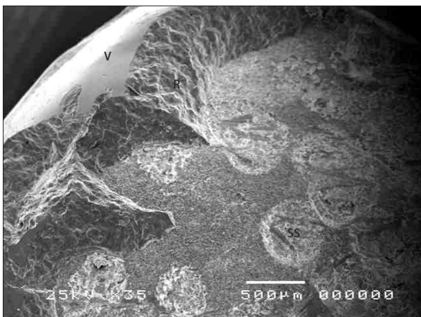
Figure 3: Veneer debonding: Spot size (SS) of about 0.5 mm corresponding approximately to the diameter of the laser sapphire tip