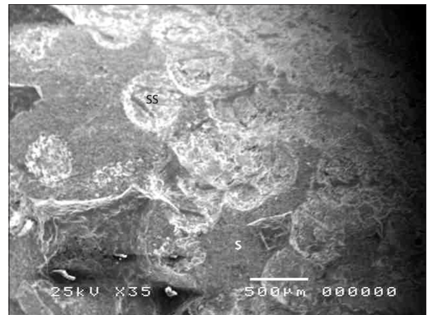
Figure 2: Broken veneer (V), sealer (S), and spot size (SS) on tooth surface